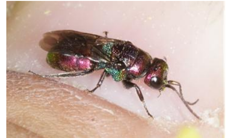
critically endangered hedychrum nobile

44 species of aculeata were identified: 24 species of wild bees 13 species of spheciformes 3 species of vespidae 2 species of spider wasps and one cuckoo wasp and one flower wasp species each