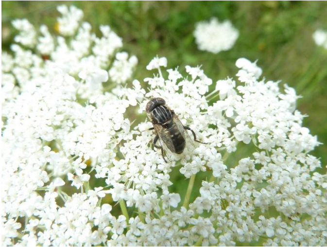
Common Lagoon Fly ( Eristalinus sepulchralis )