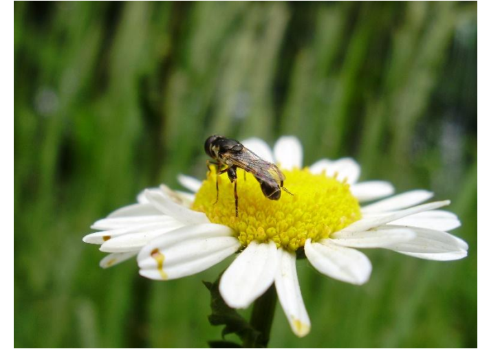
Thick-legged Hoverfly ( Syritta pipiens )