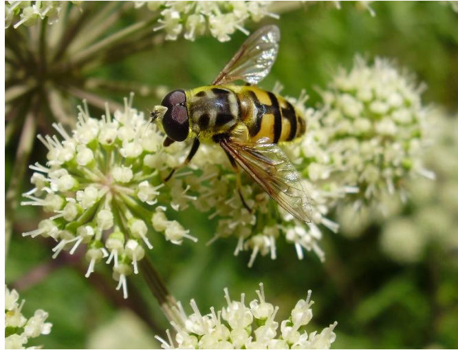
Batman Hoverfly ( Myiathropa florea )