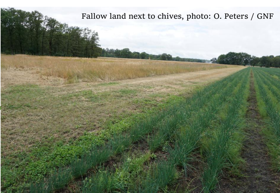
Fallow land next to chives